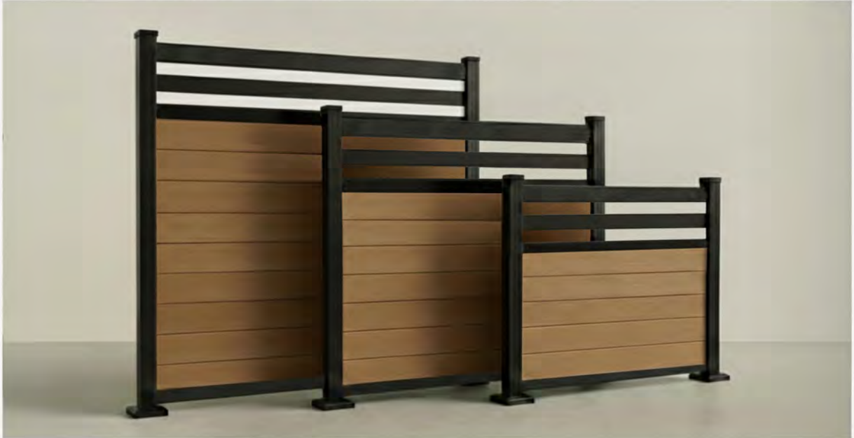
Shown in Cedar Composite for Design Identification