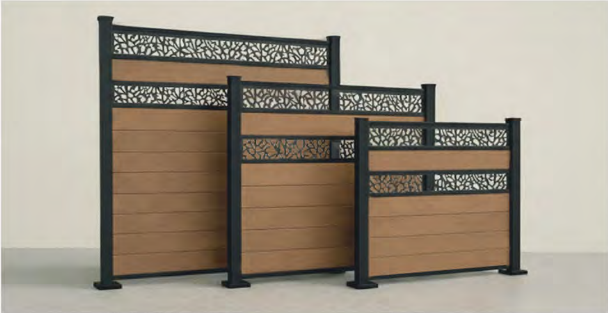
Shown in Cedar Composite for Design Identification