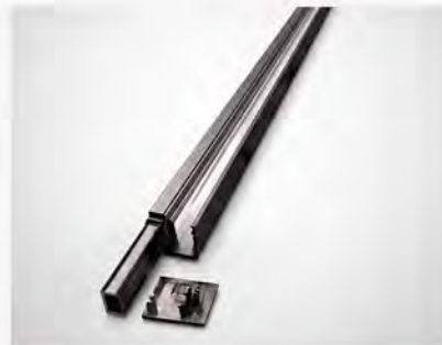
ALUMINUM U-CHANNEL KIT GWF509A $35.27