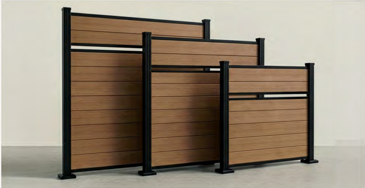
Shown in Cedar Composite for Design Identification