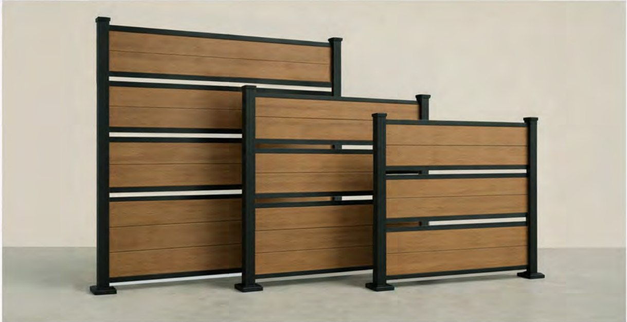
Shown in Cedar Composite for Design Identification