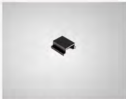
1 INCH POST TOP SPACER GWF121 $0.59