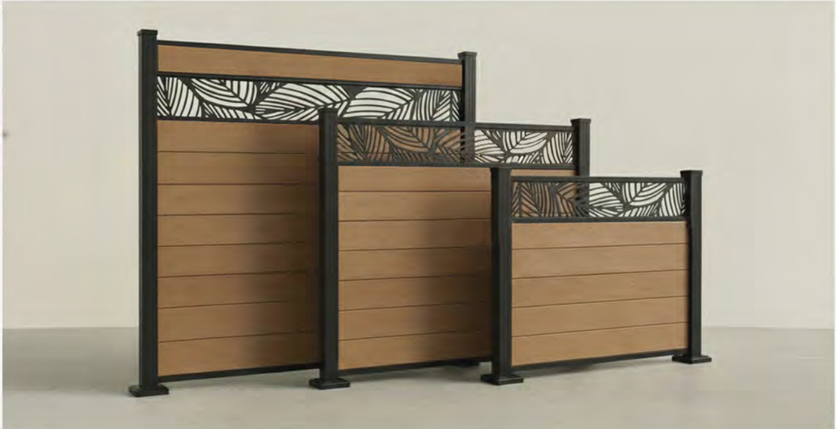
Shown in Cedar Composite for Design Identification