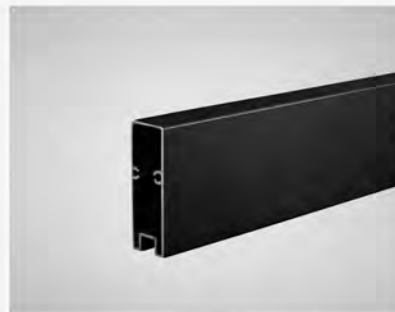
DELUXE ALUMINUM TOP RAIL GWF511AB $34.61