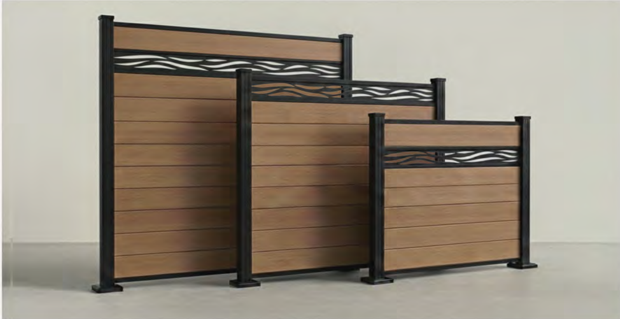
Shown in Cedar Composite for Design Identification