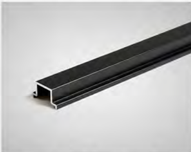
ALUMINUM SIDE POST FILLER COVER GWF503AB $6.90