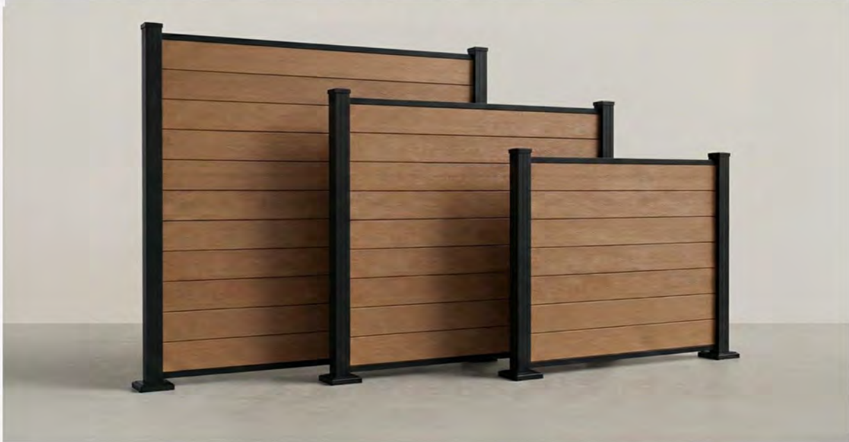
Shown in Cedar Composite for Design Identification