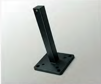
LINE POST STEEL BASE PLATE GWF507S $28.58