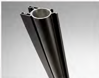
MULTI ANGLE ALUMINUM SWIVEL KIT GWF513A $59.76