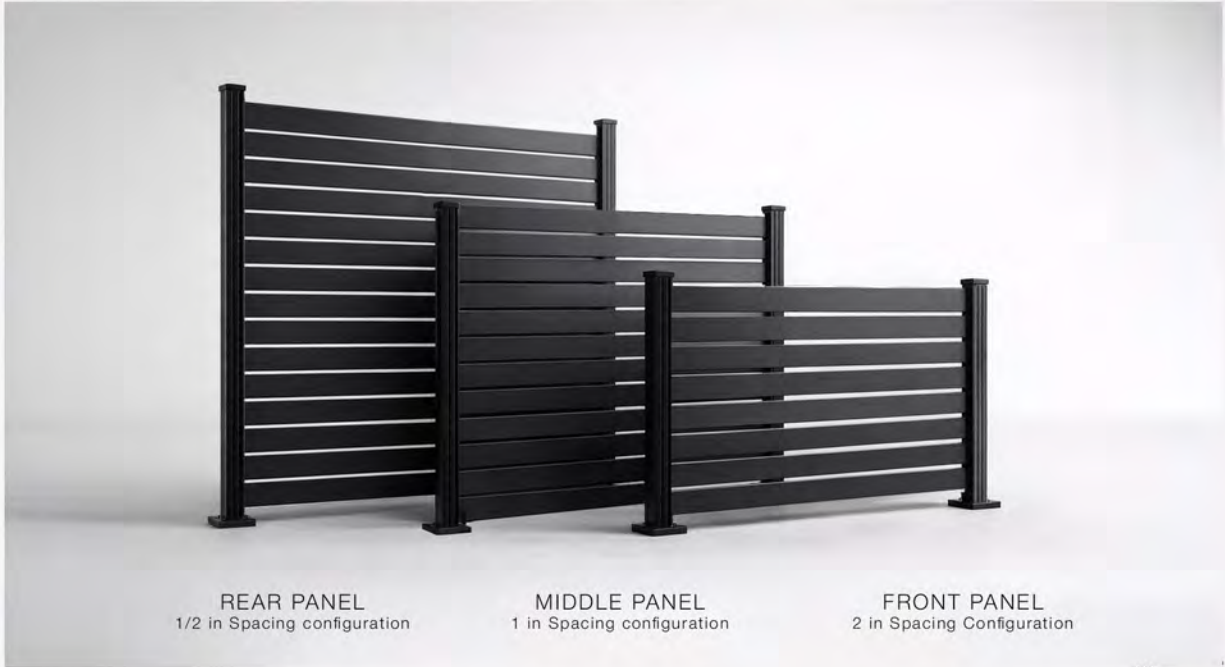
REAR PANEL 1/2 in Spacing configuration