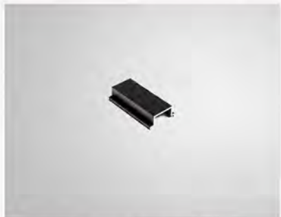
2" GAP OPENING SPACER GWF123 $0.74