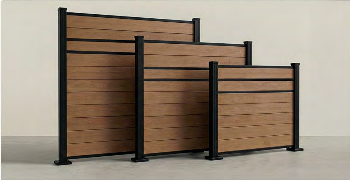
Shown in Cedar Composite for Design Identification