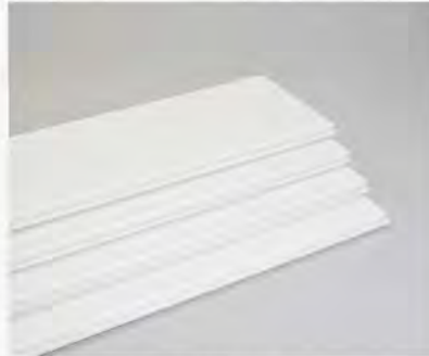
GWF VINYL BOARD (WHITE) GWF603MW (UOM: 1 EA) $14.50