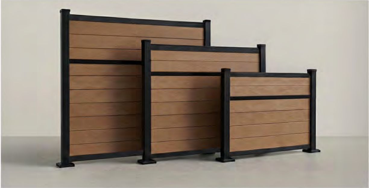
Shown in Cedar Composite for Design Identification