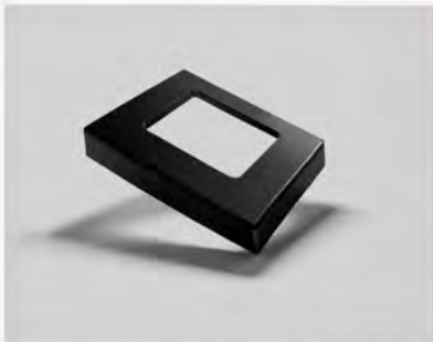
BASE PLATE COVER (4X4 GATE POST) GWF507BPC4 $20.25