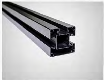
10 FT ALUMINUM POST GWF500APB $152.06