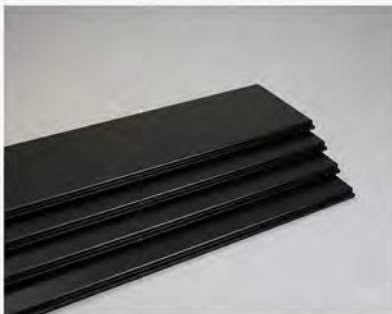
ALUMINUM BOARD (MATTE BLK) GWF403AFCH (UOM: 1 EA) $62.96