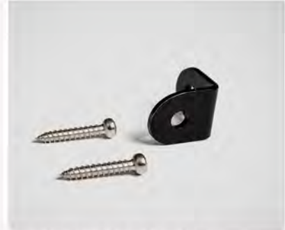
L-BRACKET FOR TOP RAIL GWF119 (UOM: 1 EA) $0.56