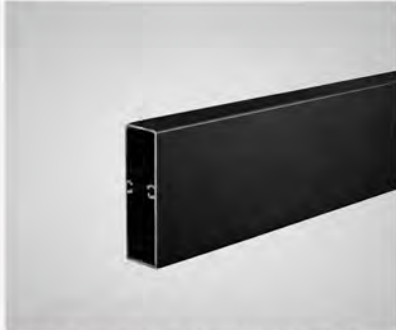
3 1/8 IN DELUXE ALUMINUM SLAT GWF512A $34.61