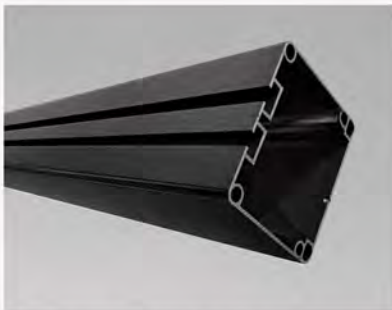
12 FT 6X6 INCH GATE POST GWF507GP $405.00