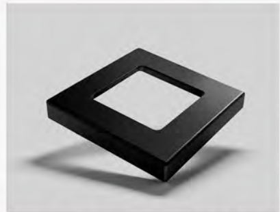
BASE PLATE COVER (6X6 GATE POST) GWF507BPC6 $27.00