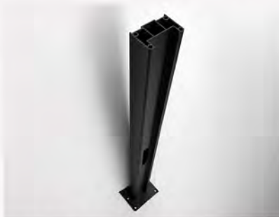
6.5 FT WALL MOUNT GATE POST GWF507AWM $180.04