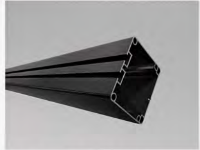
10 FT 4X4 INCH GATE POST GWF507A4 $331.00