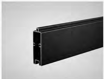
DELUXE ALUMINUM BOTTOM RAIL GWF510AB $34.61