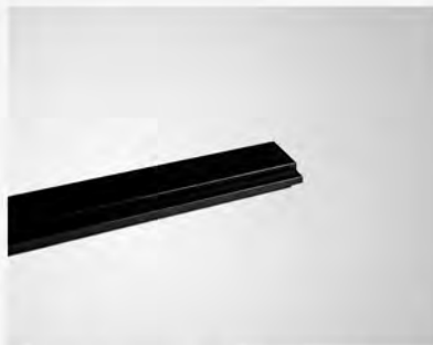
CLASSIC ALUM. BOTTOM/MID RAIL GWF504AB $20.69