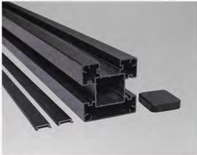
10 FT END POST KIT GWA500APB $166.19