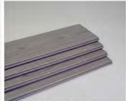
GWF VINYL BOARD (WALNUT) GWF603WGW (UOM: 1 EA) $18.94