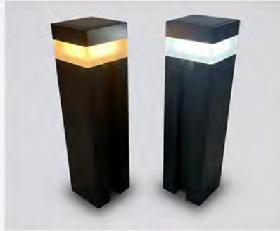
SOLAR LED POST CAP GWF110LED (UOM: 1 EA) $24.99