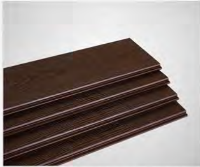
COMPOSITE BOARD (ALL COLORS) GWF403 (UOM: 1 EA) $29.93