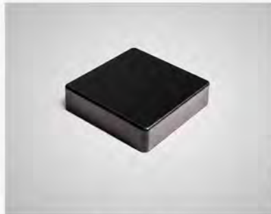
ALUMINUM POST CAP GWF110A $3.54