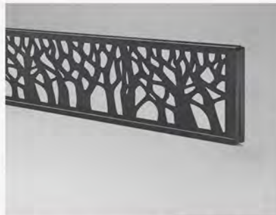
ALUMINUM ORNAMENTAL LATTICE GWF508A $97.20