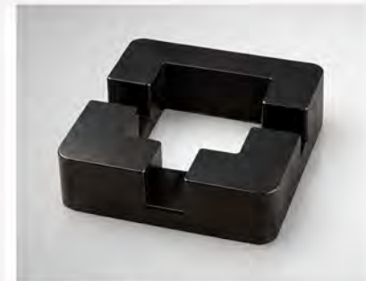
COVER CAP FOR BASE PLATE GWF507SC $14.38