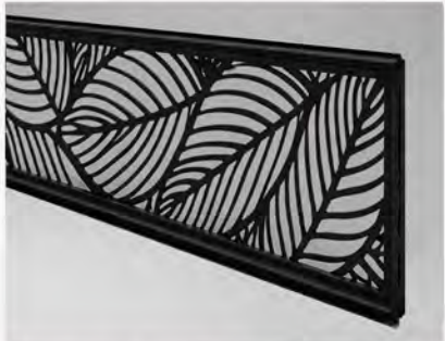
ALUMINUM LEAF LATTICE GWF508ALL $190.30