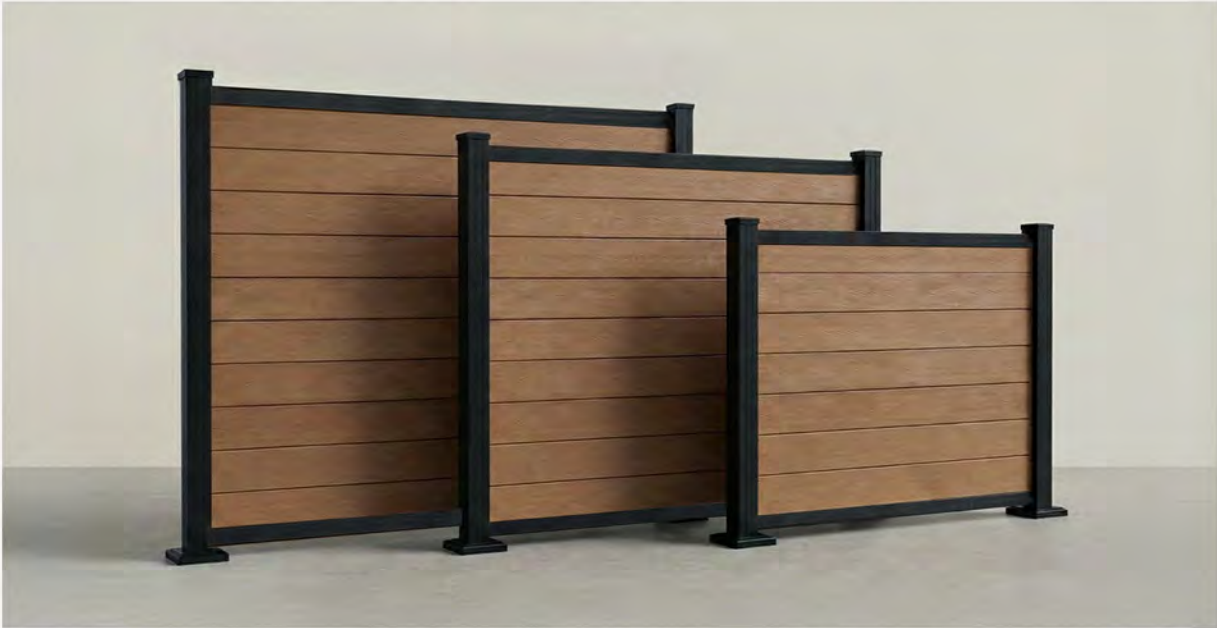
Shown in Cedar Composite for Design Identification