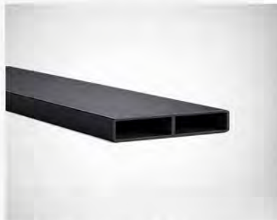
4 1/8 IN ALUMINUM SLAT GWF303A $34.61