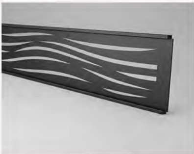
ALUMINUM WAVEFORM LATTICE GWF508AWF $97.20