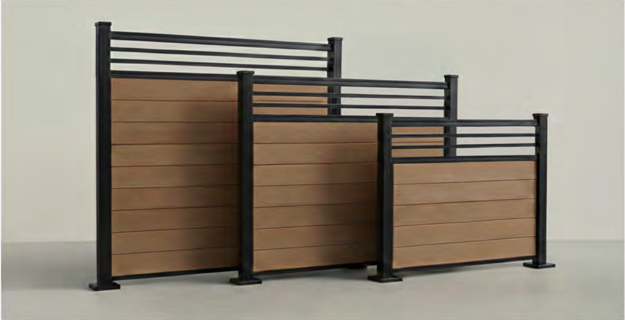
Shown in Cedar Composite for Design Identification