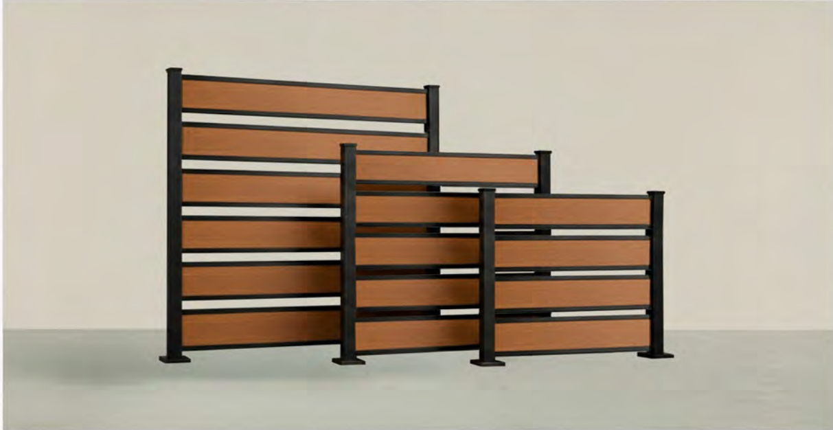
Shown in Cedar Composite for Design Identification