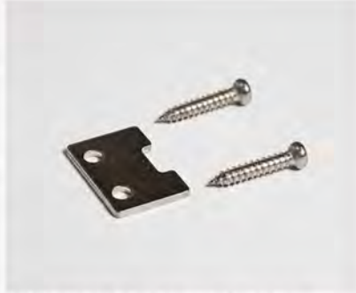
INSERTION BRACKETS (4-PACK) GWF111 $2.44