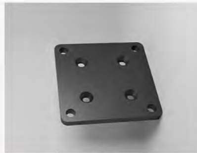
BASE PLATE FOR 6X6 INCH GATE POST GWF507ABP6 $39.50