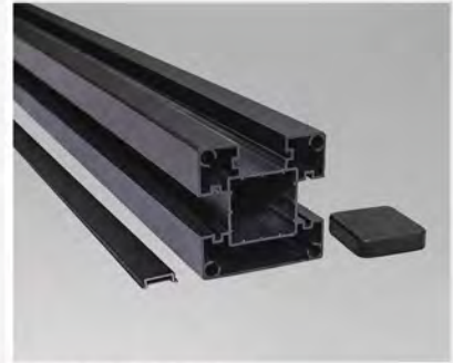
10 FT LINE POST KIT GWF500LPB $162.50