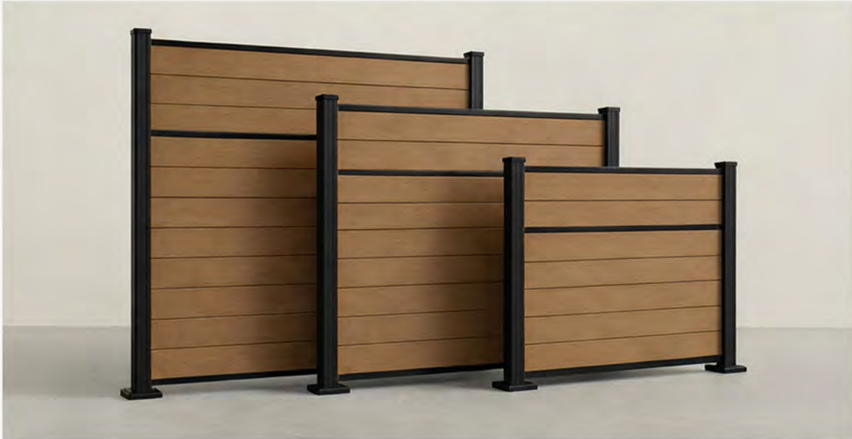
Shown in Cedar Composite for Design Identification