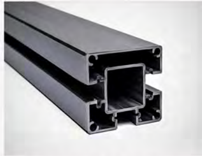
12 FT (11GA) 4X4 INCH HP POST GWF500A124 $432.71