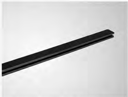
CLASSIC ALUMINUM TOP RAIL GWF506AB $20.69