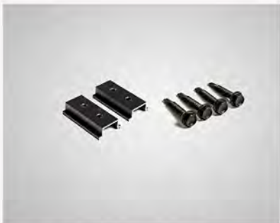
2 INCH STARTER SPACER & SCREWS GWF122 (UOM: 1 EA) $0.78